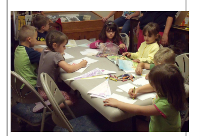
Children at a Junior Explorers program

To find out more about the programs, or if you know anyone who wants to enroll in these programs please contact us at 834-2509.