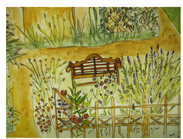
A sketch done by Heather to show her vision of the garden area at the back of The Seton Centre.

The "Birds, Bees, and Butterflies" position has been created to fill the need at the centre for someone to plan and create the butterfly garden and natural playground at the back of the centre.